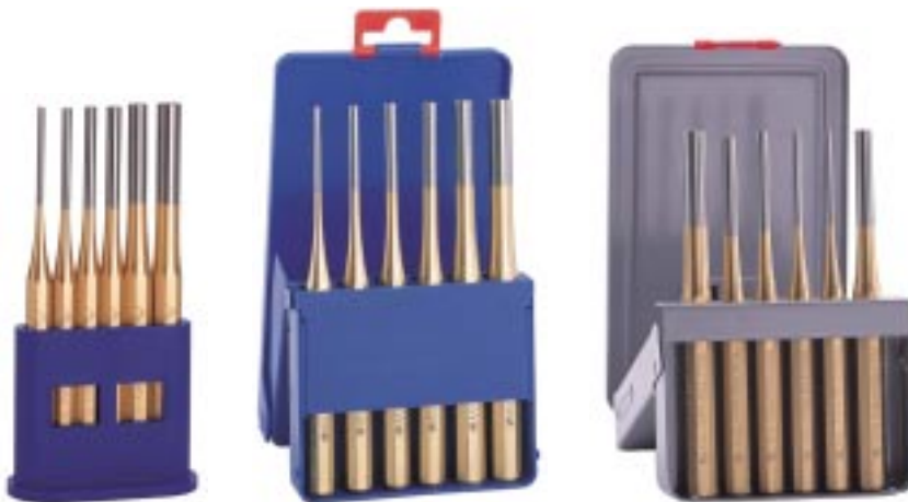
Art. No. 425 170 0 Kunststoffhalter Plastic Stand