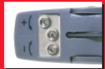
Detail of blade depth adjustment keys in bottom of stripping jaw