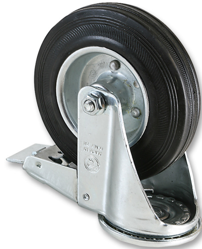
53 8221 and 53 8223