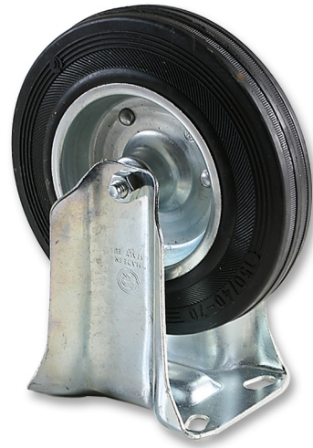
53 5903 and 53 5911