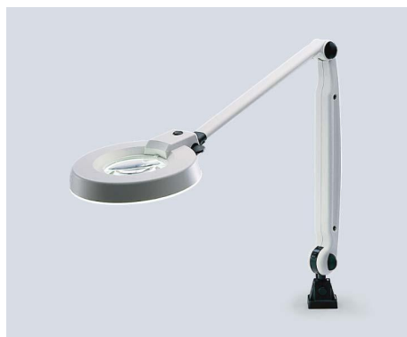
RLL 122 T