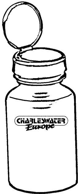
51050, 51051, 51052, 51053