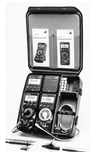
F840 (with sample contents)