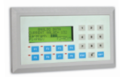
4 Line Display