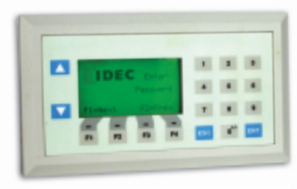
8 Line Display