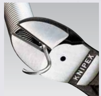
Induction hardened precision blades also suitable for piano wire