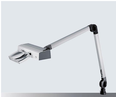
ARGUS - ARG 111