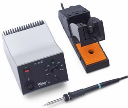
WS 81T soldering station with WSP 80 soldering pencil and WDH 10T safety rest with Stop & Go function