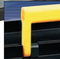
Sturdy carrying handle