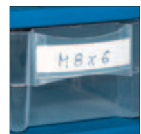
Tailor-made labels behind window