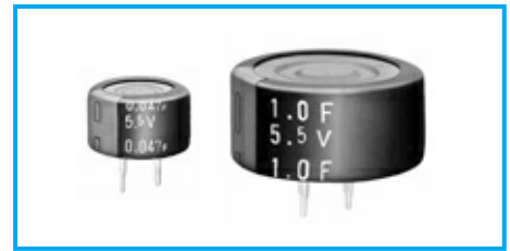
Marking color : White print on an indigo sleeve