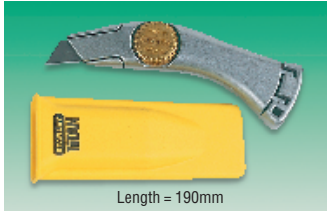
Length = 190mm