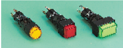
Round Bezel = 9 dia. Square Bezel = 9 9 Rectangular Bezel = 14 9

Depth behind panel (inc. terminals) = 24.5