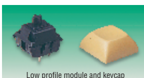
Low profile module and keycap