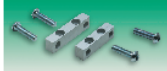
Compact Cylinder Foot Mount