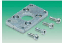
Compact Cylinder Flange Mount