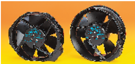
H = 150, W = 172, D = 38 Dia = 172, D = 51