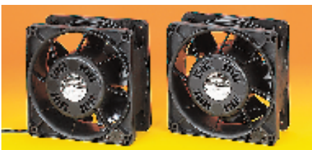
H = 175.5 W = 175.5 D = 111.80