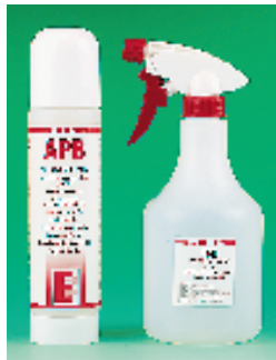
Air Powered 200ml (capacity) Trigger Spray 600ml