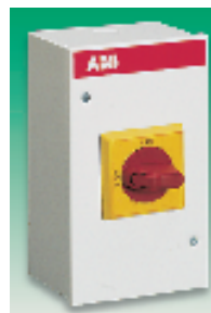
ABB Control Limited