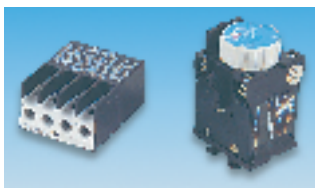
Amplifier Module Additional height to contactor = 26 Pneumatic Timer Additional height to contactor = 60