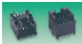
Low profile 90° Vertical