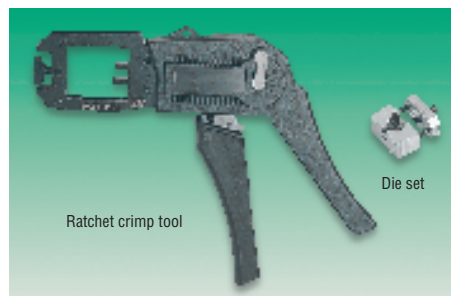
Ratchet crimp tool