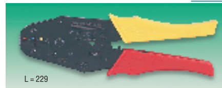
L = 229

Suitable for precision crimping of red, blue and yellow insulated terminals from 0.75 to 6mm 2 .