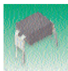
Pin spacing = 2.54, Row spacing = 7.62