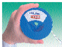
Tape width = 8mm