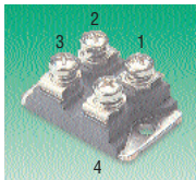
ISOTOP H = 12.2, W = 25.4, D = 38.2