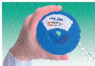
Tape width = 8mm