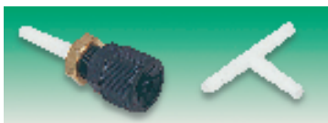
Bulkhead connector 107-277