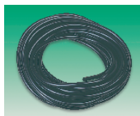
PVC tubing (10m reel) 107-279