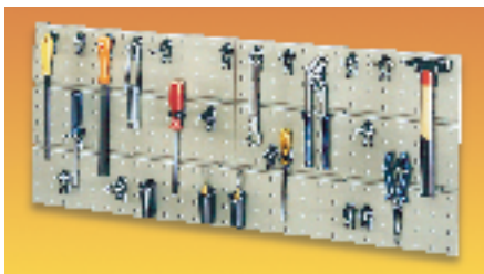
Single panel H = 440, W = 520, D = 30

Available as separate panels and clips (see 'Super Clips'), or as complete combination packs. The panels are high quality steel, primer dipped for rust protection with a strong, smooth light grey enamel finish.