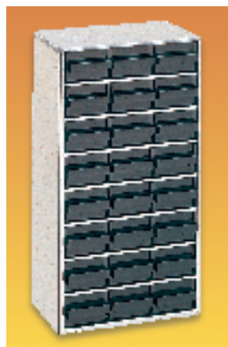
24 drawers: H = 57, W = 87, D = 135