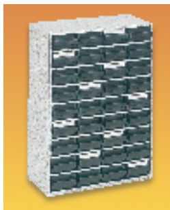
36 drawers: H = 35, W = 64, D = 135