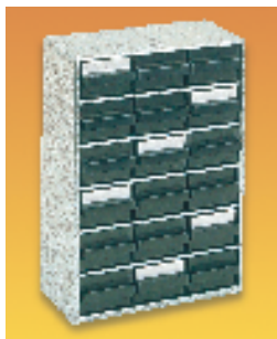
18 drawers: H = 57, W = 87, D = 135