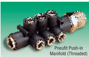
Pneufit Push-in Manifold (Threaded)