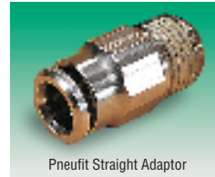
Pneufit Straight Adaptor