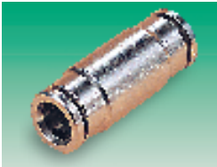
Pneufit Push-in Straight Connector