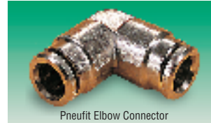
Pneufit Elbow Connector