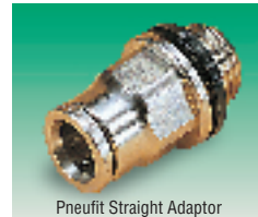
Pneufit Straight Adaptor