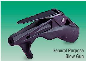
General Purpose Blow Gun