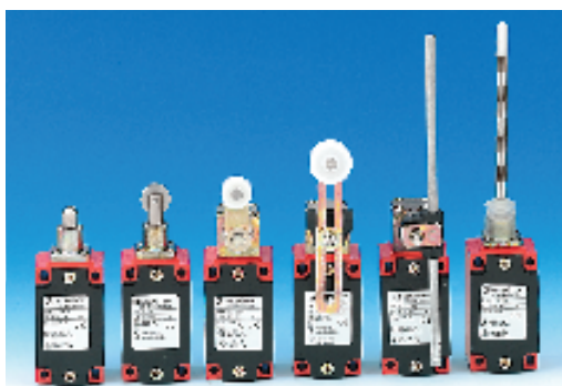
Body H = 73.5 (excluding head), W = 40, D = 40 Fixing centres = 60 30mm