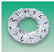
Figure Dials — 1452 Series