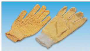
Nominal size 9