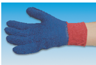
Length 260 Thickness 2.5 nominal Colour Blue