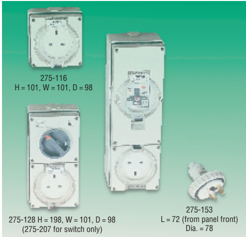
275-116 H = 101, W = 101, D = 98