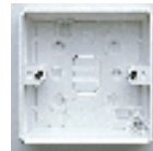
30mm Box H = 87, W = 87 (2 gang = 148) Fixing centres = 60.3 (2 gang = 120.6)