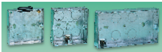
16mm Deep Switch Box H = 72, W = 72 Fixing centres = 60.3