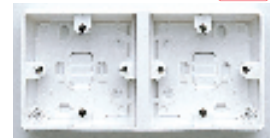
Dual 2 1 Gang 38mm Box H = 86, W = 172 Fixing centres = 2 60.3