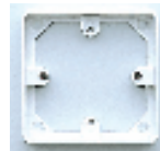
20mm Mounting Frame H = 87, W = 87 Fixing centres = 60.3