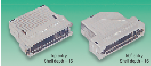
Top entry Shell depth = 16